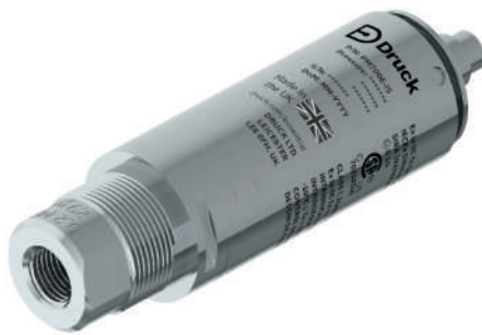
PM700E (Gauge, Absolute)