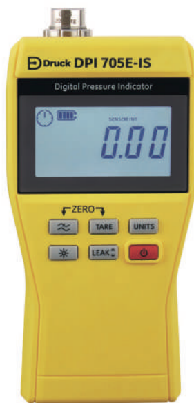
Hazardous Area Pressure Indicator

The Druck DPI 705E Series of handheld pressure and optional temperature indicators combine tough and rugged design with accurate and reliable measurements.